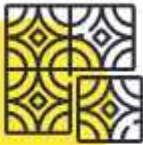
Ceramic, Tiles & Sanitaryware