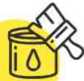
Paints, Gypsum Board