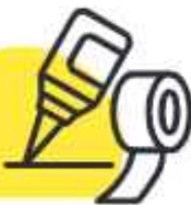
Glue, Adhesive & Chemicals