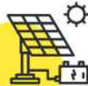
Renewable Energy & Rooftop