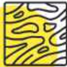
Marble, Granite & Stone