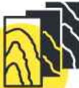
Timber, Plywood, Laminates & Flooring