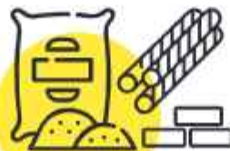
Cement, TMT Bars, AAC Blocks