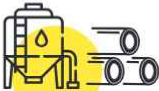
CP, Pipe Fittings