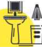
Hardware, Bath Fittings & Sink